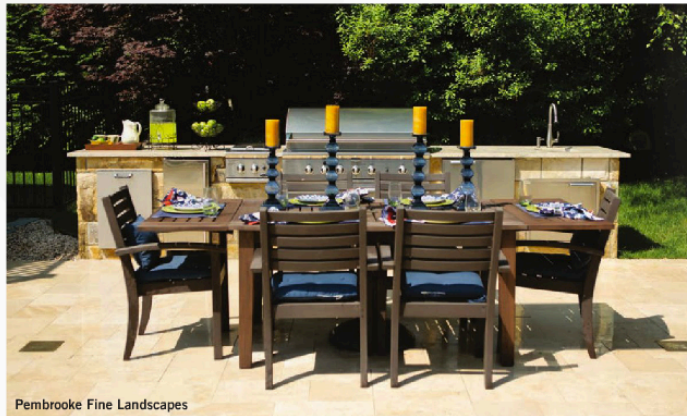
Pembroke Fine Landscapes

- Bill D’Agata, Pembroke Fine Landscapes